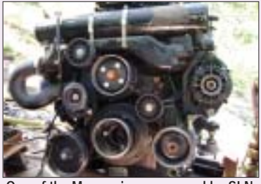
One of the Mercruisers recovered by SLN

The Naval Intelligence recently recovered four US-built inboard engines acquired by the Sea Tigers to power attack craft, which posed a formidable threat to the Navy.