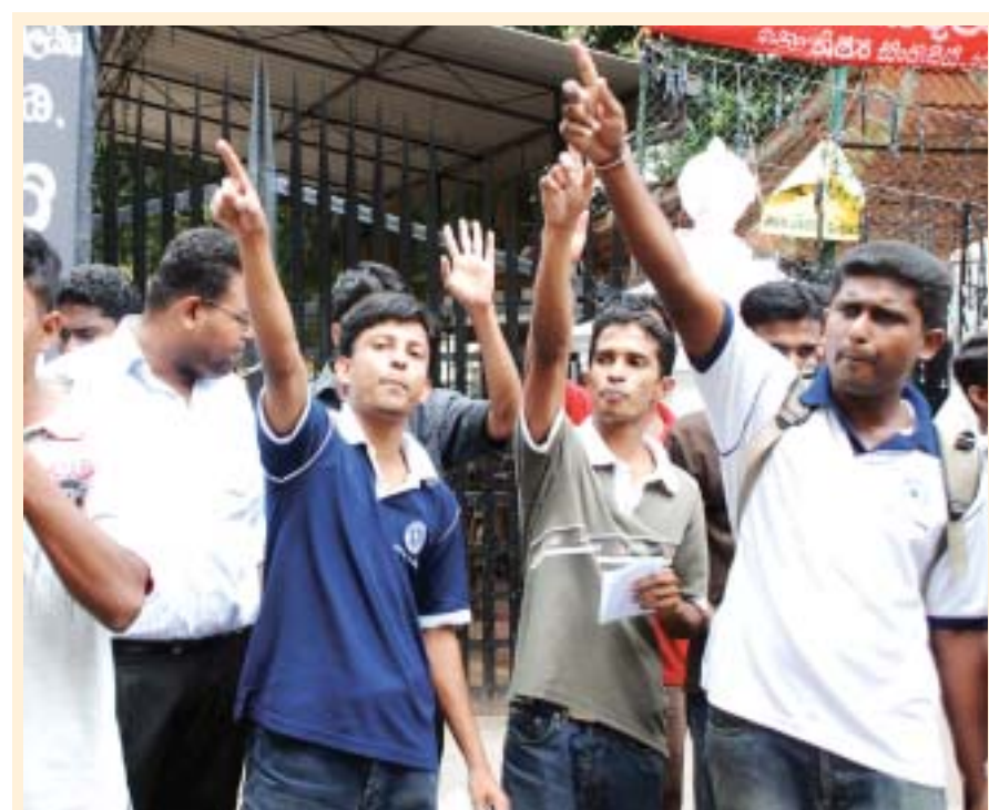
Members of the Students' Council of the Peradeniya University protest opposite the University Grants Commission in Colombo yesterday against the failure of the authorities to enroll students for the Allied Health Sciences Faculty.