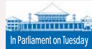
In Parliament on Tuesday