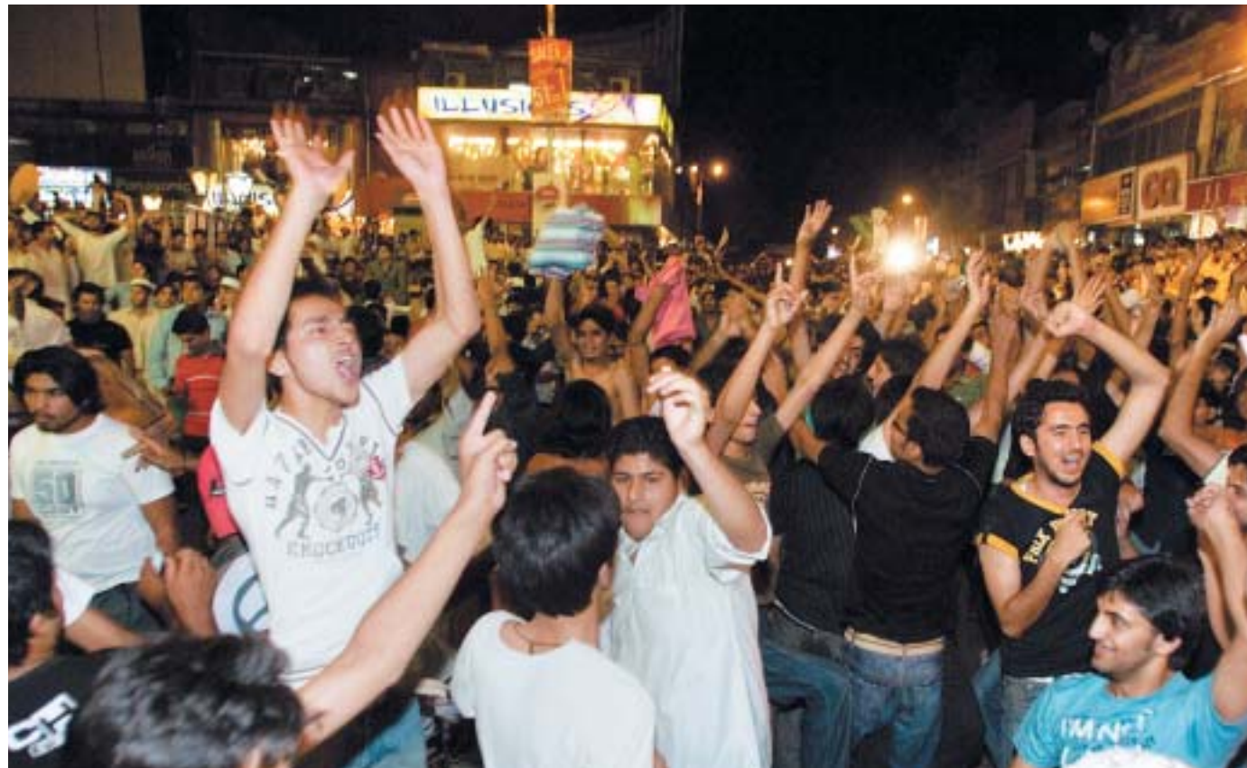
Pakistani cricket fans in Islamabad, Pakistan, on Sunday, June 21, 2009, celebrate their country's cricket team victory in the final of Twenty20 World Cup against Sri Lanka, which was played in London.

Pakistan's government barred its players from competing in the Indian Premier League just before the tournament was shifted to South Africa, giving all of their opponents whose players participated in the much-publicised and