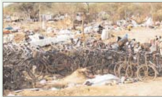
Thousands of bicycles left behind by the civilians, who fled the no fire zone during the last stages of the war, were collected by Army from several locations in Vellaimullaivaikkal, the place of the last battle. The bicycles are to be handed over to the owners when they return from the welfare camps