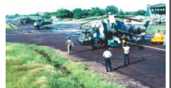
SLAF helicopter gunships at Hingurakgoda air base

The Mi-24 squadron comprises about 35 officers and 375 men. We caused chaos along their frontline in the Vanni theatre. They were never allowed to settle in and zero-in on attacking choppers, he said. Responding to The Island queries, he said that as they engaged targets right across the Vanni theatre from the north-western coast to the north-eastern coast, the enemy couldn't concen-