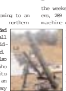
A large cache of weapons and ammunition recovered by the army

With major combat operations coming to an end in the northern theatre, the armed forces spearheaded by the army and police would now go all out to recover arms and ammunition hidden by the LTTE, security officials said. They said that authorities would also have to track down LTTE cadres who had gone underground in the city and its suburbs. Responding to our queries, an intelligence official said that the recovery of weapons abandoned on the ground by retreating LTTE cadres would be easy. The difficult task would be to locate hidden armaments, he said.