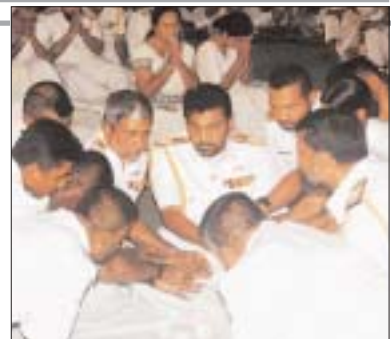
Navy Commander Admiral Wasantha Karannagoda and senior officers participate in religious observances to invoke blessings on officers and men killed in war against terrorism. This was a scene at the strategic Trincomalee navy base on Sunday (May 24).

House in Kandy. Sources said that the President had also emphasised the urgent need to apprehend and deport to Sri Lanka LTTE frontliner KP believed to be operating in a South East Asian country and other LTTE leaders operating overseas. KP wanted by Interpol and India over the assassination of Congress I leader Rajiv Gandhi is required to face trial in Sri Lanka. He runs the LTTE's arms procurement ring and is reportedly making an effort to revive the LTTE.