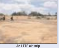
An LTTE air strip

The SLAF would set up a small station at one of the two LTTE runways in the Inneswadi area east of the A9 road, SLAF spokesman Wing Commander Jarako Narayakura told The Island. He said that the SLAF would use the bigger one. We'll also take over the runway situated close to Mullativu, he said.