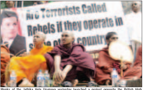
Monks of the Jalnika Hela Urumaya yesterday launched a protest opposite the British High Commission against the UK's opposition to the elimination of terrorism in Sri Lanka.