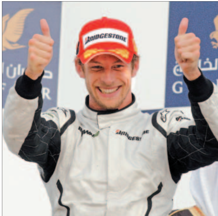
Brawn GP driver Jenson Button of Britain celebrates on the podium after winning the Bahrain Formula One Grand Prix at the Bahrain International Circuit, in Sakhir, Bahrain, Sunday, April 26, 2009.

Ferrari's points avoided it going through the first four races of the season without a point for the first time in its F1 history.