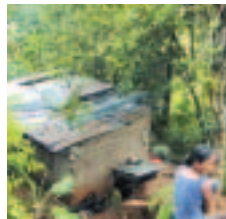
House damaged in Tirivanaketiya

People in the affected areas said a thick fog had accompanied the cyclonic winds that lasted for about 15 minutes. About 25 houses in Batugedera, Tirivanaketiya, Pahala Hakkamawwa and Ratnapura city area were damaged.